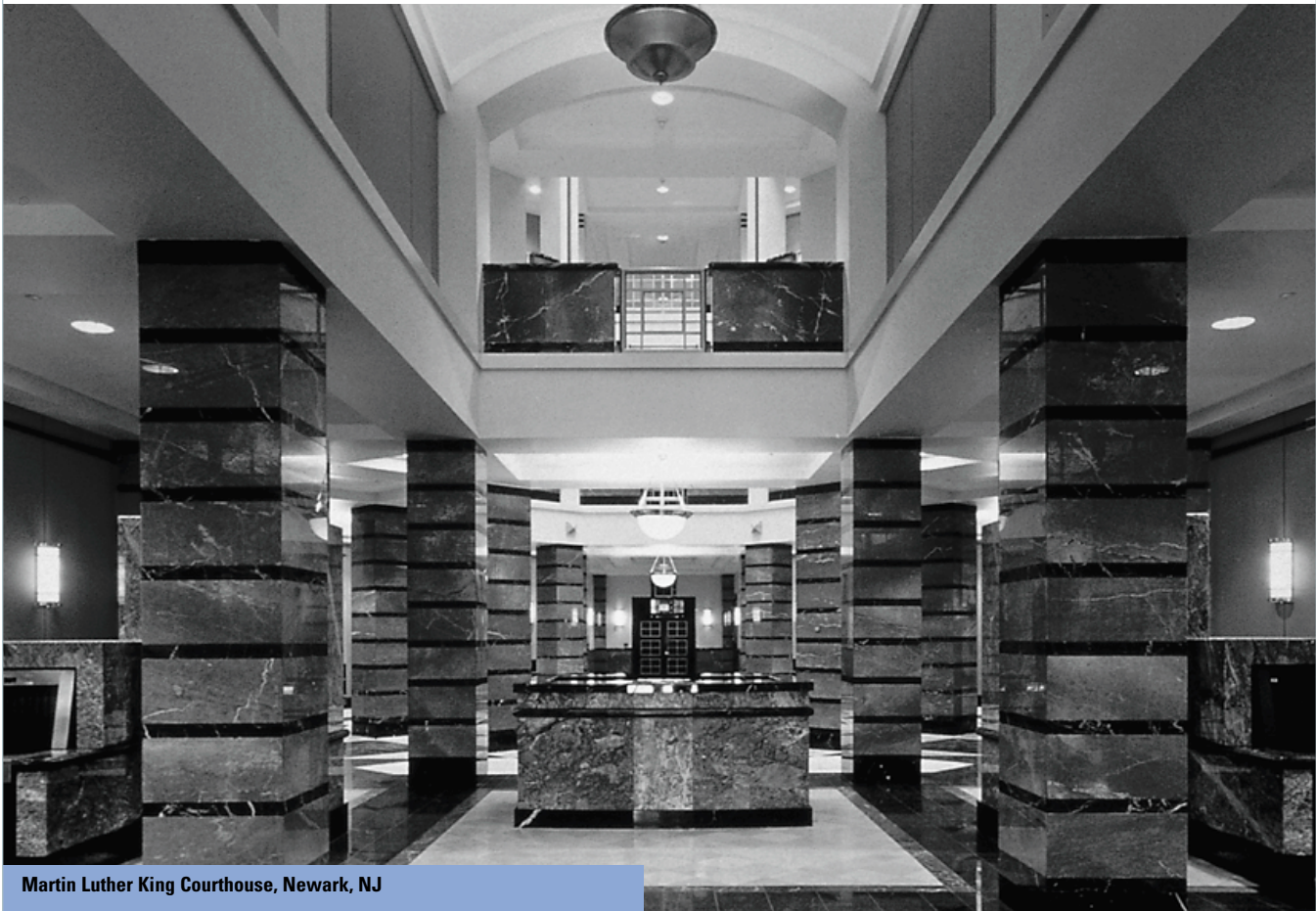
Martin Luther King Courthouse, Newark, NJ

IMPORTANT NOTE: The following criteria do NOT apply to all projects. Follow each criterion only if instructed to by your project-specific risk assessment.