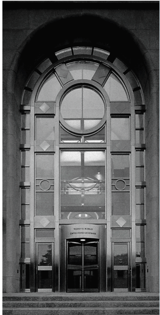
Warren B. Rudman Courthouse, Concord, NH

Roof Access. Design locking systems to meet the requirements of NFPA 101 and limit roof access to authorized personnel.