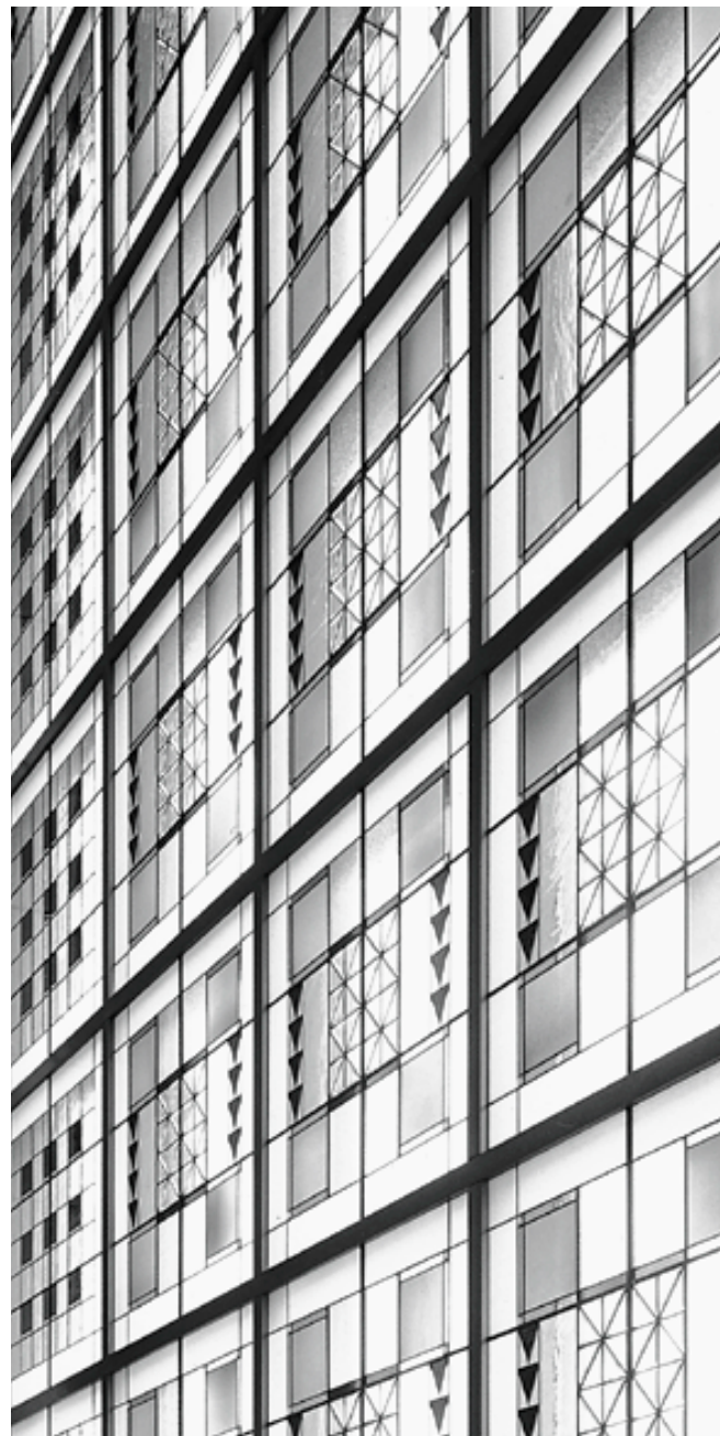
Robert C. Byrd Courthouse, Charleston, WV

This glazing should meet the minimum performance specified in Table 8-2. However, special consideration should be given to frames and anchorages for ballistic-resistant windows and security glazing since their inherent