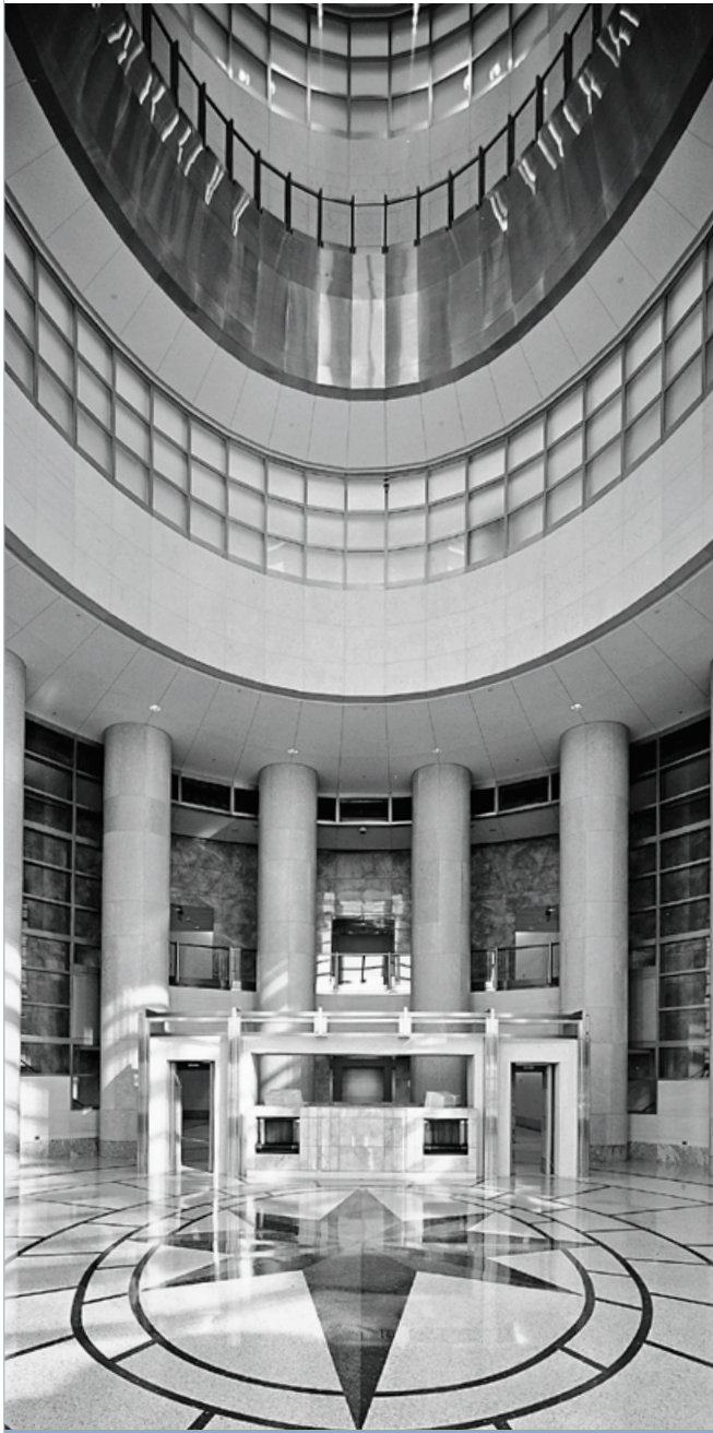
Thomas Eagleton Courthouse, St. Louis, MO

Access Control and Electronic Security. Electronic security, including surveillance, intrusion detection, and screening, is a key element of facility protection; many aspects of electronic security and the posting of security personnel are adequately dealt with in other criteria and guideline documents. These criteria primarily address access control planning - including aspects of stair and lobby design - because access control must be considered when design concepts for a building are first conceived. While fewer options are available for modernization projects, some designs can be altered to consider future access control objectives.