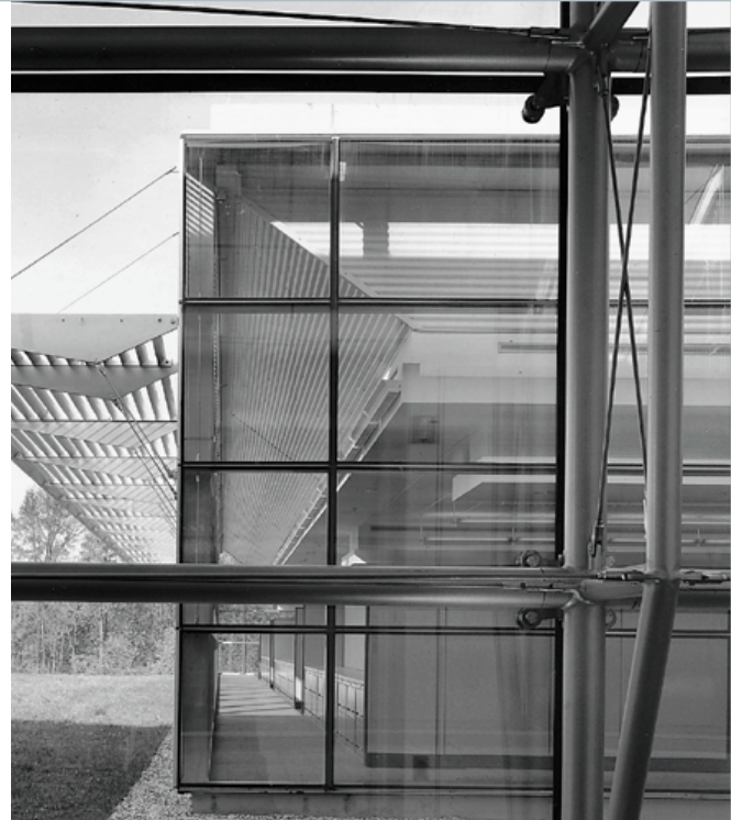
U.S. Census Bureau, Bowie, MD