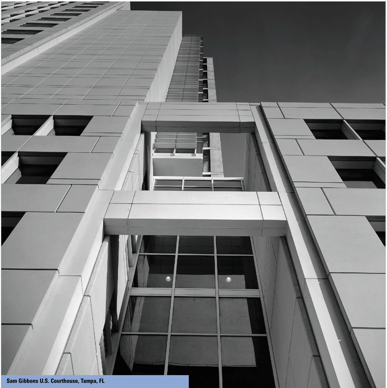
Sam Gibbons U.S. Courthouse, Tampa, FL