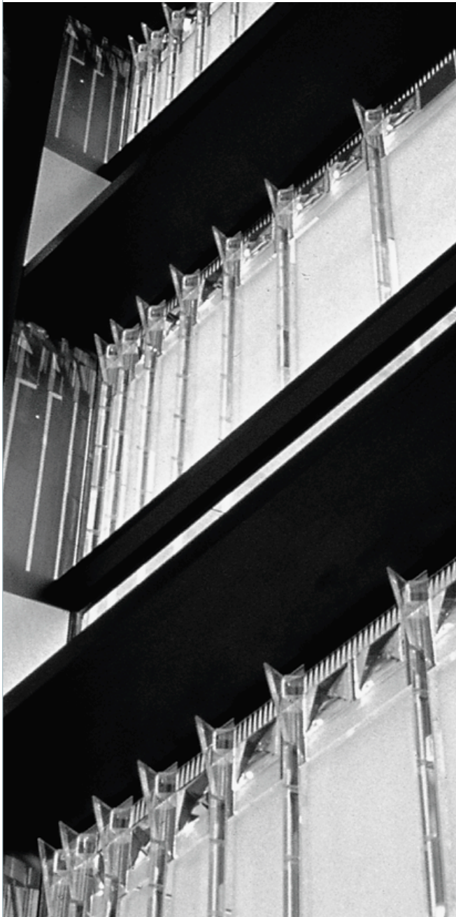
Oakland Federal Building