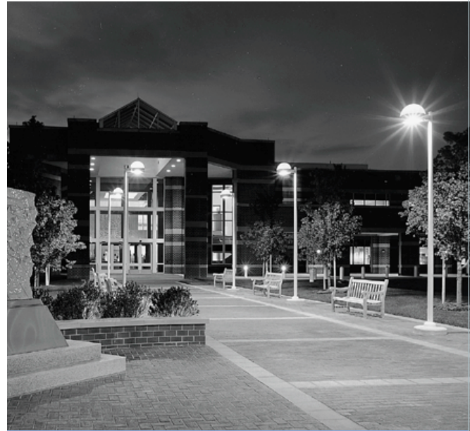
Philadelphia Veterans Center

IMPORTANT NOTE: The following criteria do NOT apply to all projects. Follow each criterion only if instructed to by your project-specific risk assessment.