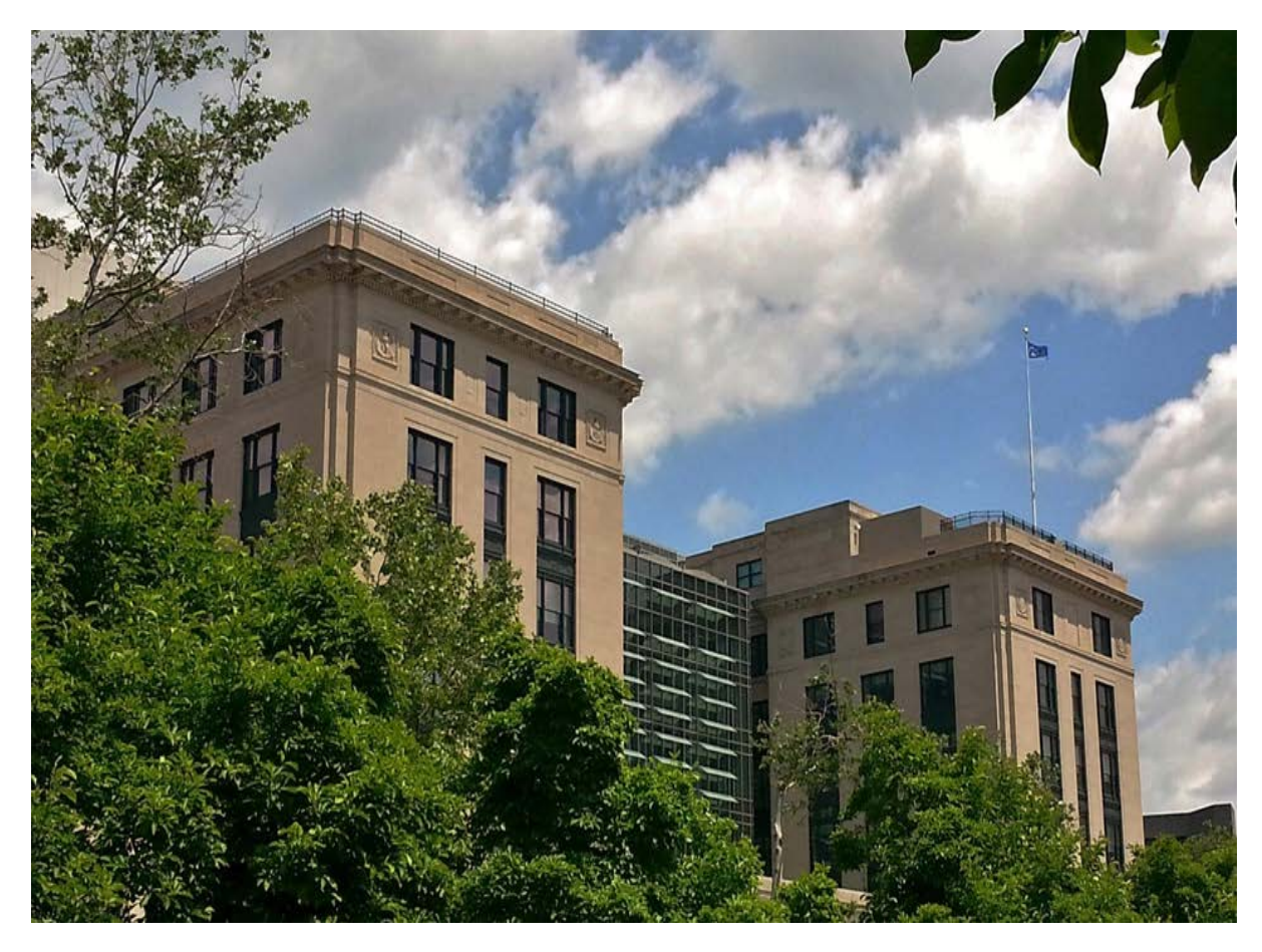
U.S. General Services Administration 1800 F Street, NW Washington, DC 20405