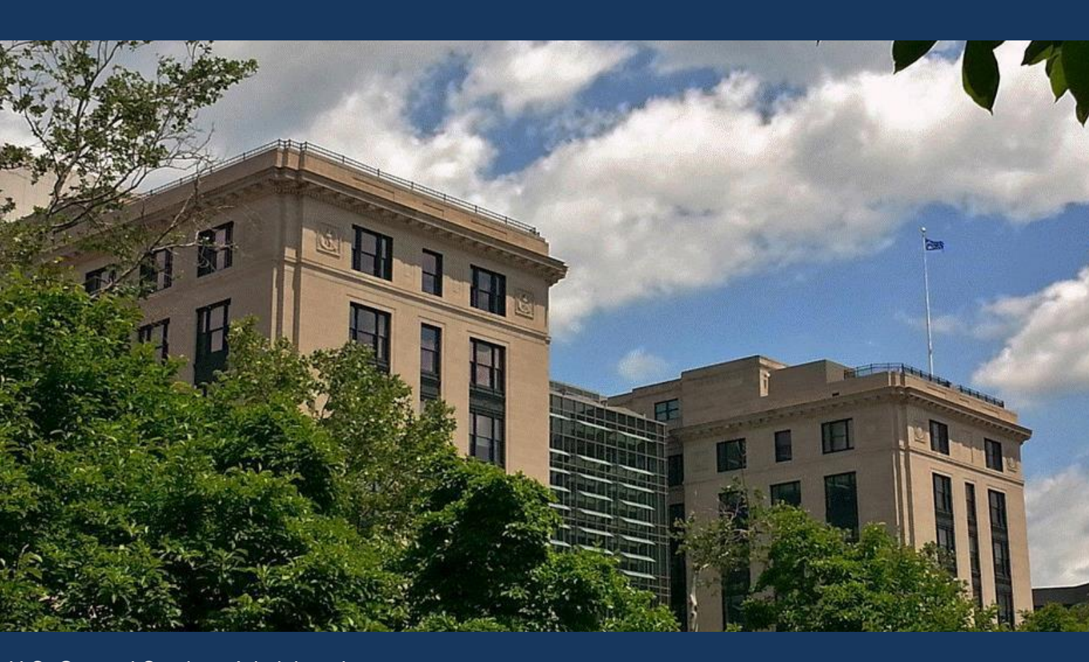
U.S. General Services Administration 1800 F Street NW, Washington, DC 20405