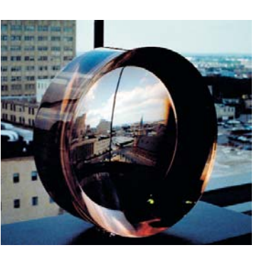
Sculpture as originally installed on the ninth-floor of the Murrah Federal Building.

Materials/Medium: Acrylic Sculpture Dimensions: 1'8" x 1'6" Location: Ninth-floor elevator lobby Artist: Fred Eversley